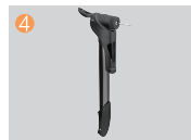
Insert the air needle into the air hole to pump air.