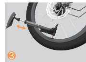
Hold the handle tightly and pull to pump up