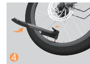
After pumping up, put away the handle and restore the lock