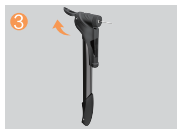
After installing the air needle, open the lock.