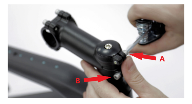
3. Tighten A, B screws.

*To confirm that the fork is in the right position, check if the brake disks are on the same side of the bike.